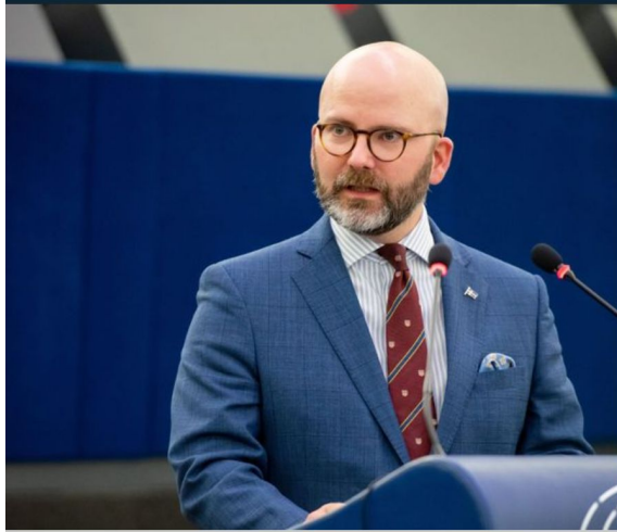
Charlie Weimers member of the European Parliament

The NUFDI unveiled a 15-point document consisting of action plans and strategic tools for the provision of maximum support as a complement to the US policy of “maximum pressure”, which holds the promise of creating a more complete framework for US-Iran policy.