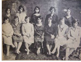
The Society of Patriotic Women was established.