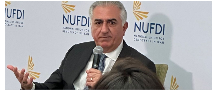
Iran's exiled Prince Reza Pahlavi speaking at an event held by the National Union for Democracy in Iran (NUFDI) on March 13, 2023